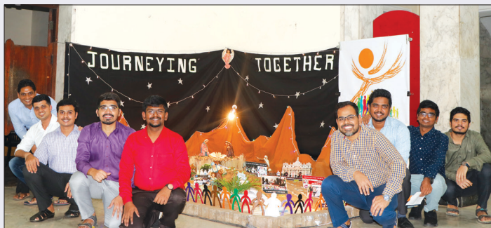
Christmas Crib Decoration 2021