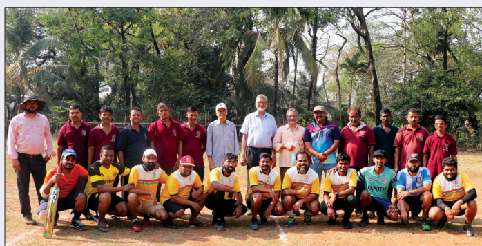
Cricket Match: Non-Teaching Staff vs Seminarians