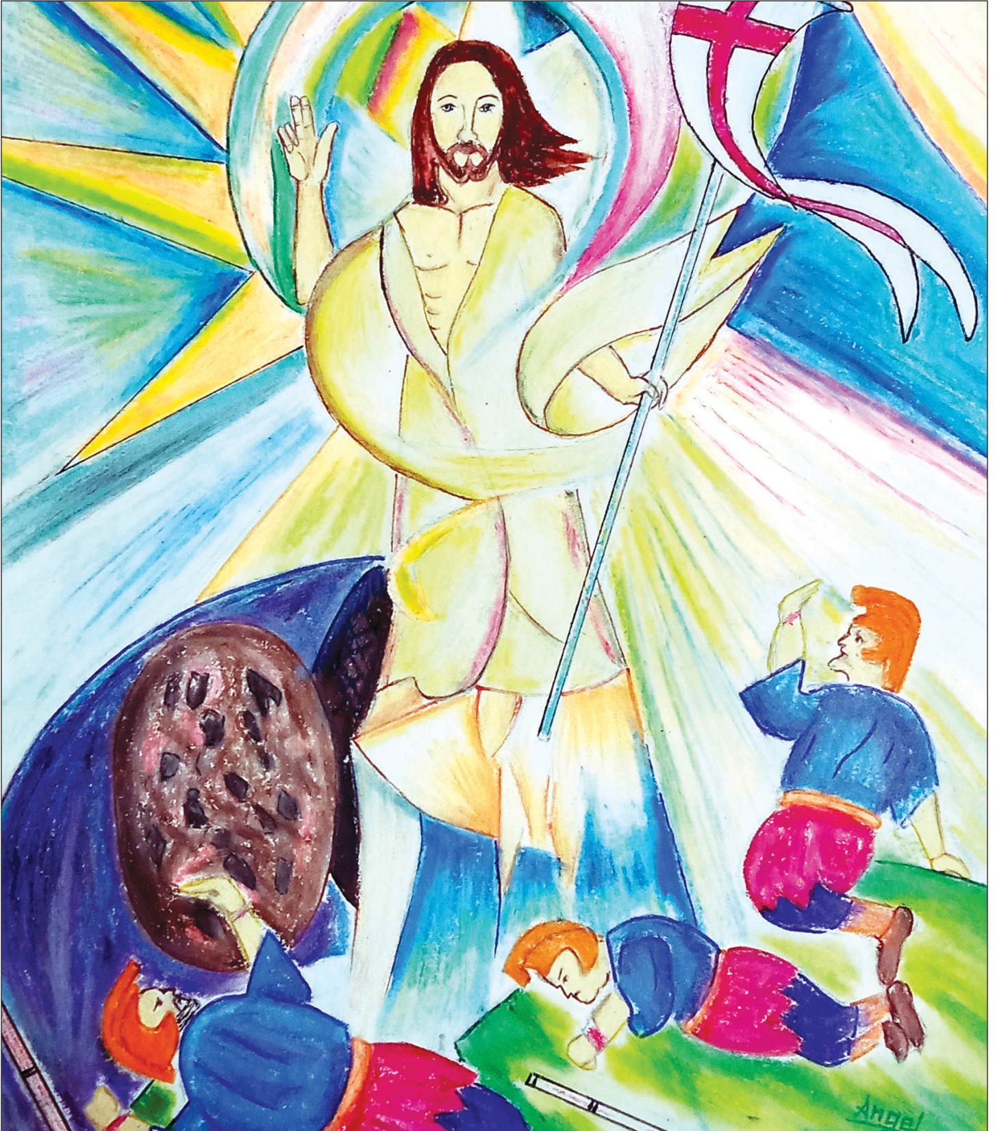
Cover Image by Br Angel Patil